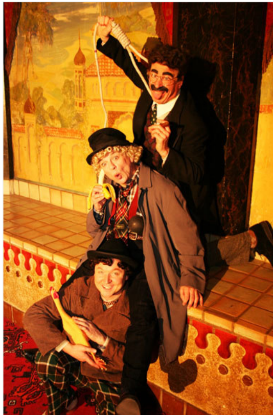
"A Day in Hollywood/A Night in the Ukraine" runs through April 4.

"I fall down a lot running around, I skate on a single roller skate, I ride a bike and fall off, then turn it upside down and go off stage," he says. "Harpo is such a stock character, with his horn and his whistling. I drink the ink from an inkwell. I eat a flower. It's great material and really a lot of fun."