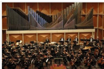
The Milwaukee Symphony Orchestra.

Cirque de la Symphonie , Milwaukee Symphony Orchestra, Marcus Center Uihlein Hall, 1/1-1/3